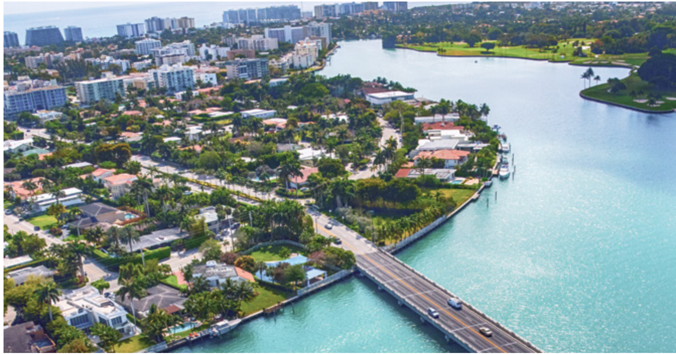
BAY HARBOR ISLANDS

From Aventura and Sunny Isles to the downtown skyline and panoramas of Biscayne Bay, residents enjoy unparalleled access to Miami's most sought-after areas. Relax at home in a quiet enclave at Solana Bay or embrace South Florida's nearby signature shopping, five-star dining, and world-class entertainment. The options are endless.